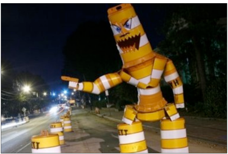
The creator of this 'barrel monster' says it's street art. The police say it's vandalism.